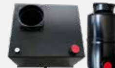
Hydraulic tanks (steel)