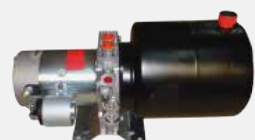
DC mini-power plants

Specific mini-power plants: loading dock, vehicle lifts, etc.