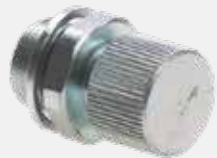
N2 charging valves