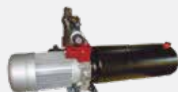
AC mini-power plants