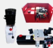
Loading dock and vehicle lifts