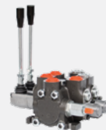
Manual modular spool valves

Pressure and temperature control: pressure gauges, protectors, thermostats, pressure switches, pressure transducers, digital thermometers.