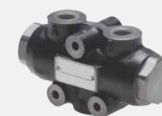
Flow dividers: sliding