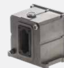
Hydraulic tanks (aluminium)